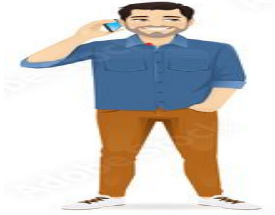
Filthy Rich Dictator-Hitler Type one step shy