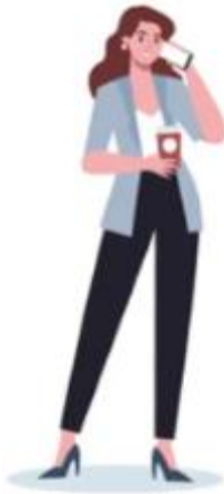
Poor Female Human