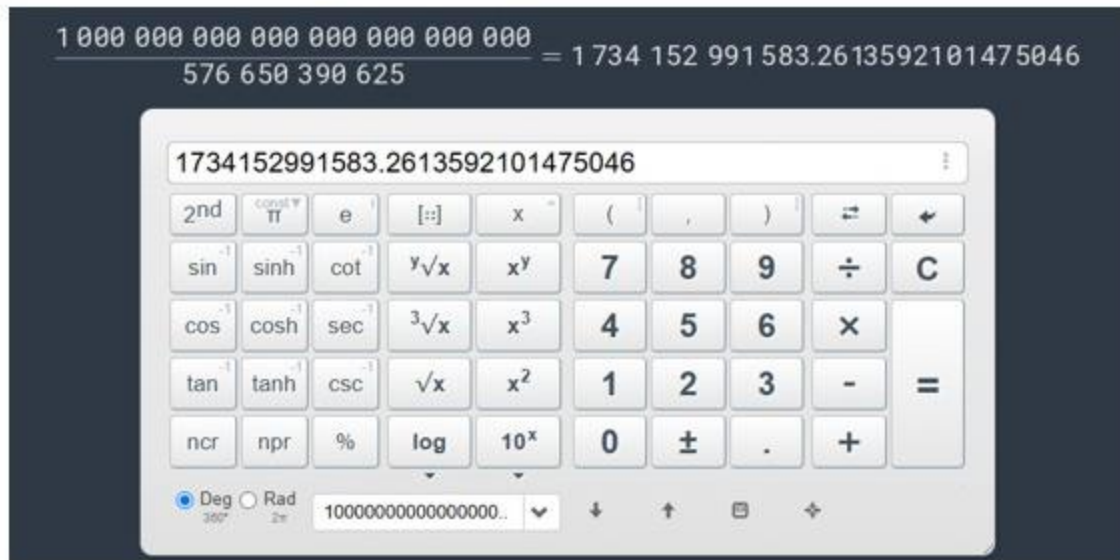
Figure 1 : The ratio of God's abilities and humans

The ratio is 10^{24} / 15^{10} = 1\ 734\ 152\ 991\ 1583.3 .. in this case God is mightier by a ratio number of 1 734 152 9911583.3 G 0