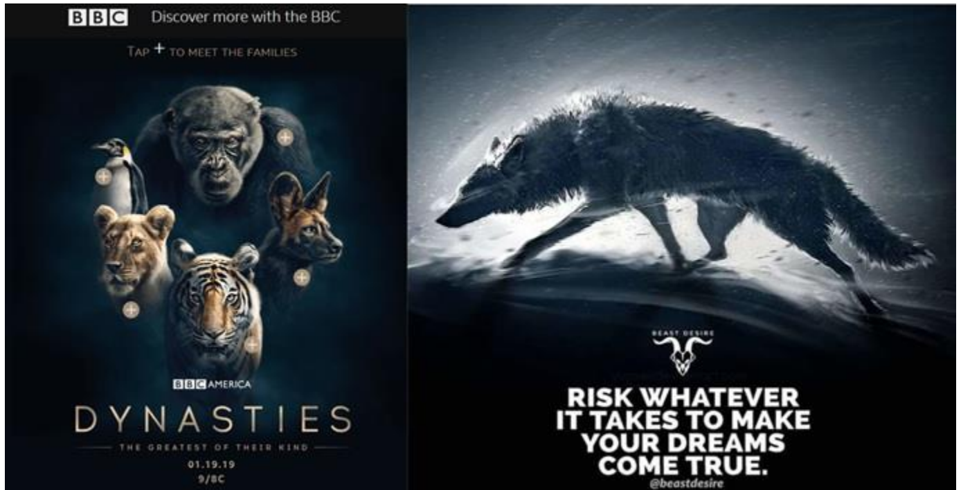
Figure 8: Dynasties Vs Progressive Politics of Modern Smart Citizens